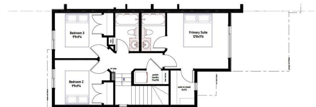
UNIT SQFT - UPPER 630sq ft