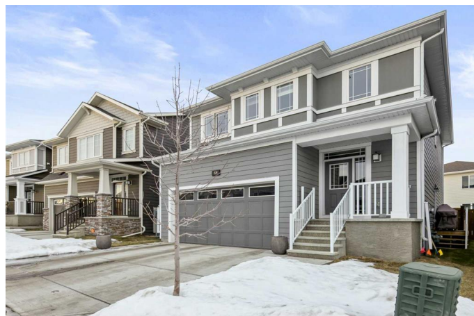
68 YORKVILLE PASSAGE SW RES. MEASUREMENTS PROVIDED BY CANADIAN MAIN LEVEL (AG) - 894.59 Sq Ft / 83.11 m 2 UPPER LEVEL (AG) - 1,219.08 Sq Ft / 113.25 m 2 TOTAL ABOVE GRADE RMB SIZE - 2,113.67 Sq Ft / 196.36 m 2

** QUICK POSSESSION READY ** Shop and compare! ** This popular Mattamy home model has the best home quality you want! This large 2-story has over 2113+ sq ft of bright, airy living space and a coveted basement side entry. Pinterest details include modern décor & colors, custom trims/baseboards, high 9' ceilings, and "CHEFS STYLE KITCHEN," making this a perfect entertaining home. Gorgeous kitchen with island / flush breakfast bar, huge walk-in pantry, white QUARTZ counters, under cabinet lighting, dramatic island with an undermount stainless steel sink, recessed pot lights, stainless steel appliances, and white subway tile backsplash detail. It is an exquisite home. The main floor family room also has a sleek fireplace & lots of room to relax. Upstairs, you'll find three bedrooms, an upper laundry room & a bonus room with white railings, and a storage closet. The primary bedroom features a 4-piece ensuite - his & hers stations (Upgraded separate shower) and an oversized walk-in closet. Exterior: Two side yards (not a zero lot line), cement fiber siding, and covered entry. The pie-shaped backyard is fully fenced and landscaped – this home is ready to move into and enjoy! Don't miss this opportunity. Call your friendly REALTOR(R) to book your viewing right away!