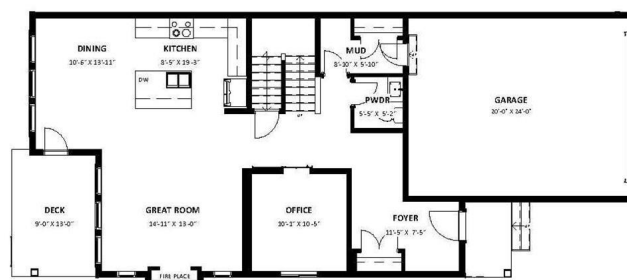
MAIN 1,085 SQ.FT. GARAGE 477 SQ. FT.