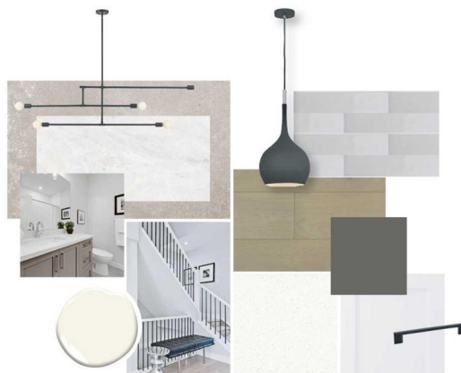
#2, 3550 45 STREET SW MOOD BOARD - FINISHES & SPECIFICATIONS

*Images are for inspiration purposes only.